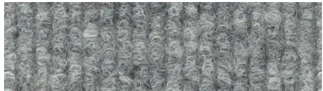
4985 Light Grey