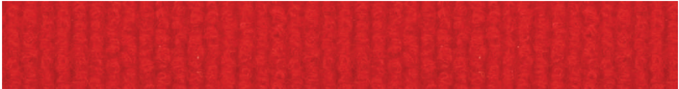
4312 Brick Red

Colour variation might be slightly more important from one batch to another.