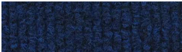
4014 Night Blue